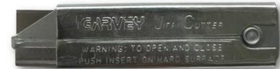
Composition of the Box Cutter